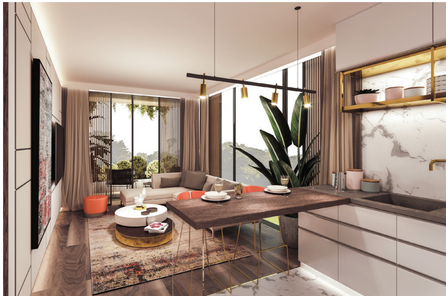
T2 LIVING ROOM

Living in Garden Hills means absorbing nature and embracing peace and quiet. It is having the leisurely and relaxing lifestyle you have always dreamed of.