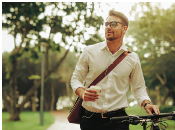
RUA JOÃO HOGAN