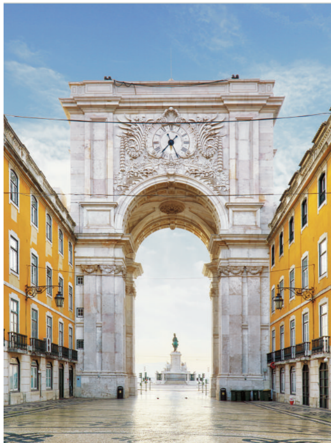
LISBON'S VIEW TO TAGUS RIVER