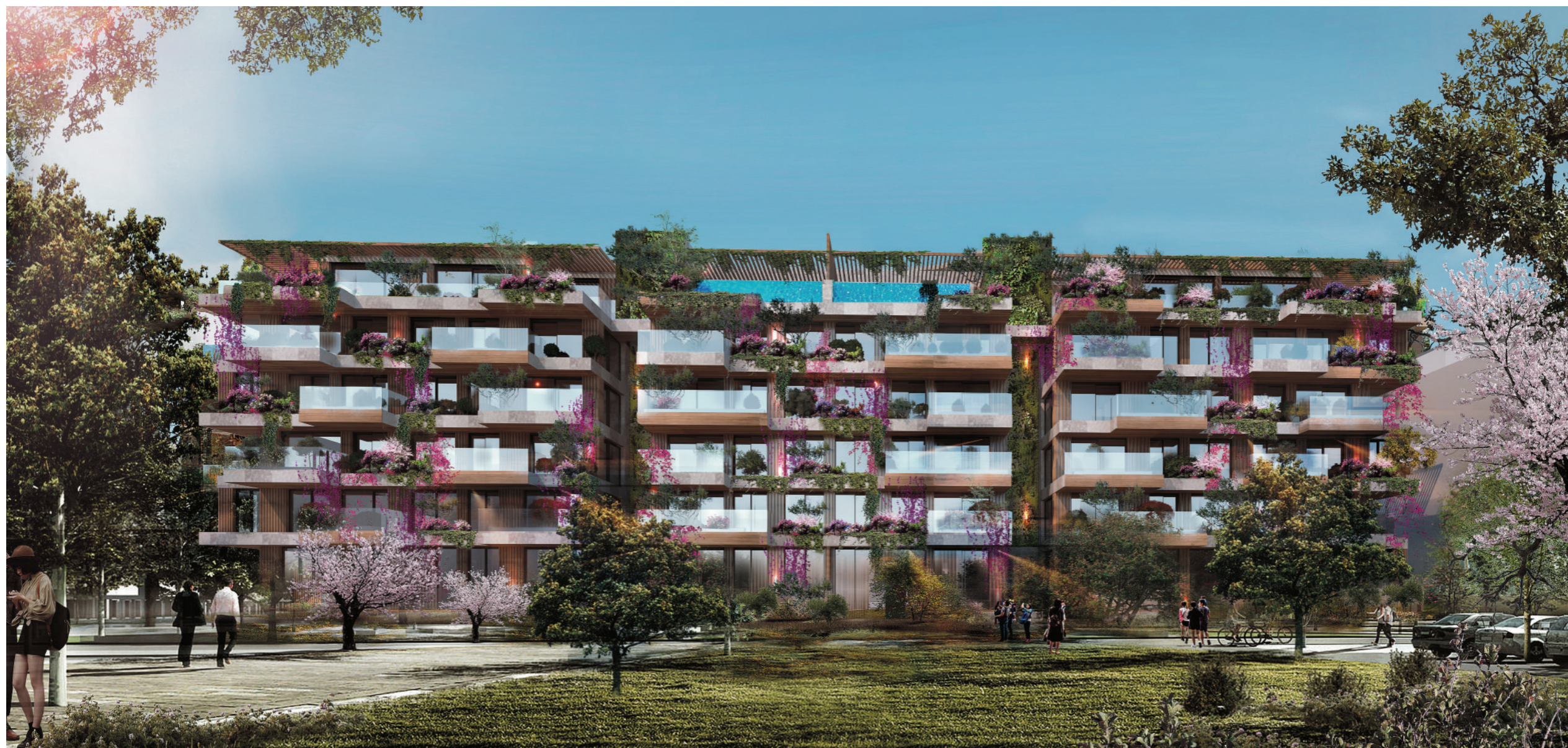
GARDEN HILLS' MAIN FAÇADE