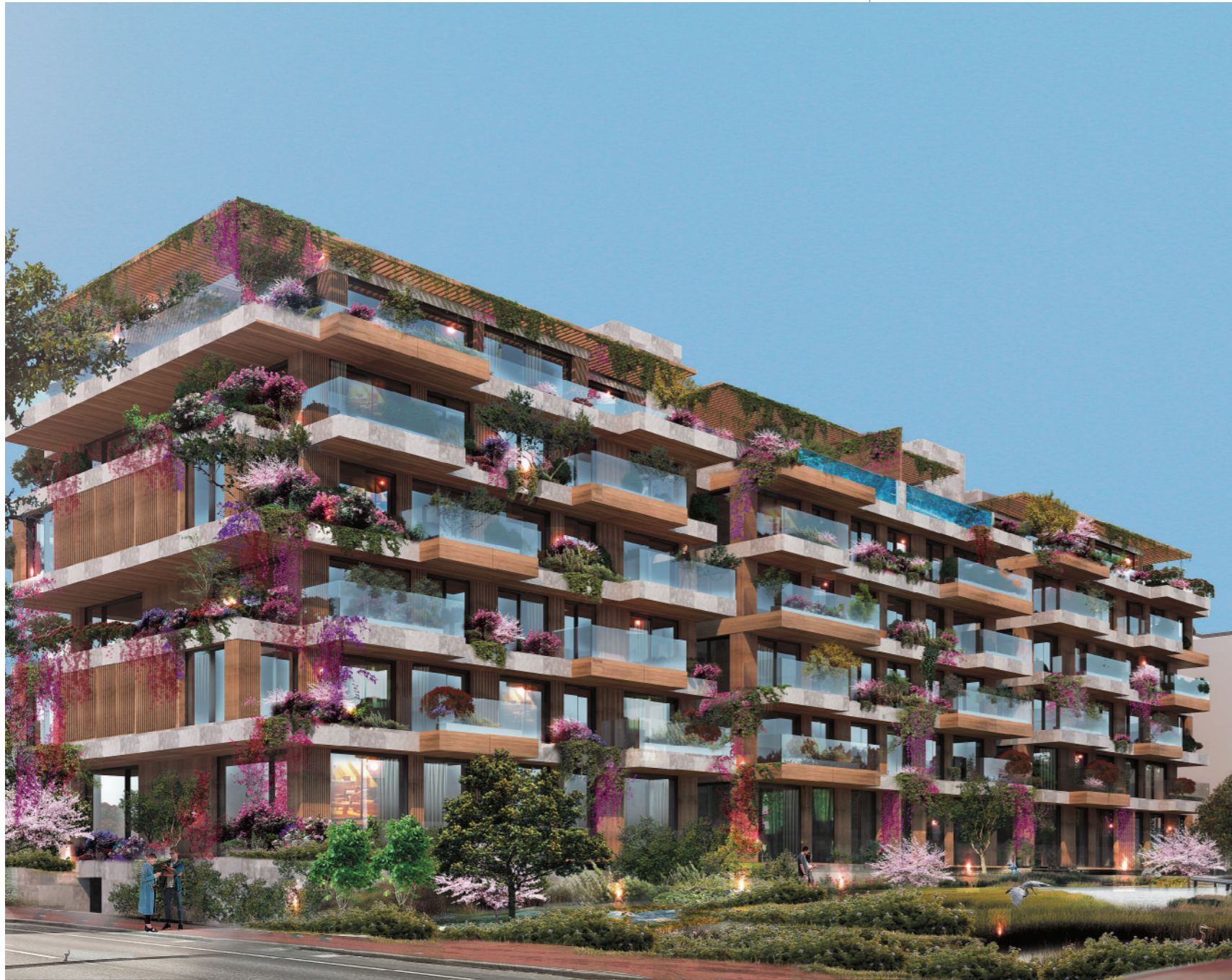
GARDEN HILLS' MAIN FAÇADE

With an area over 8000 m2, Garden Hills means luxury and sophistication.