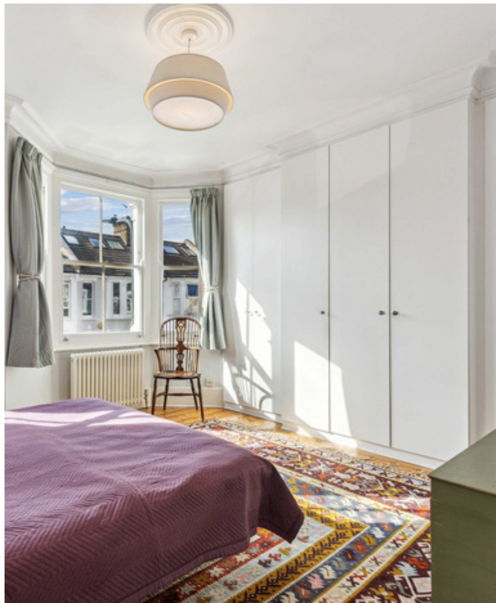
Upstairs, the principal bedroom offers a calm retreat at the end of the day, with built-in storage to keep things tidy and plenty of space to breathe.