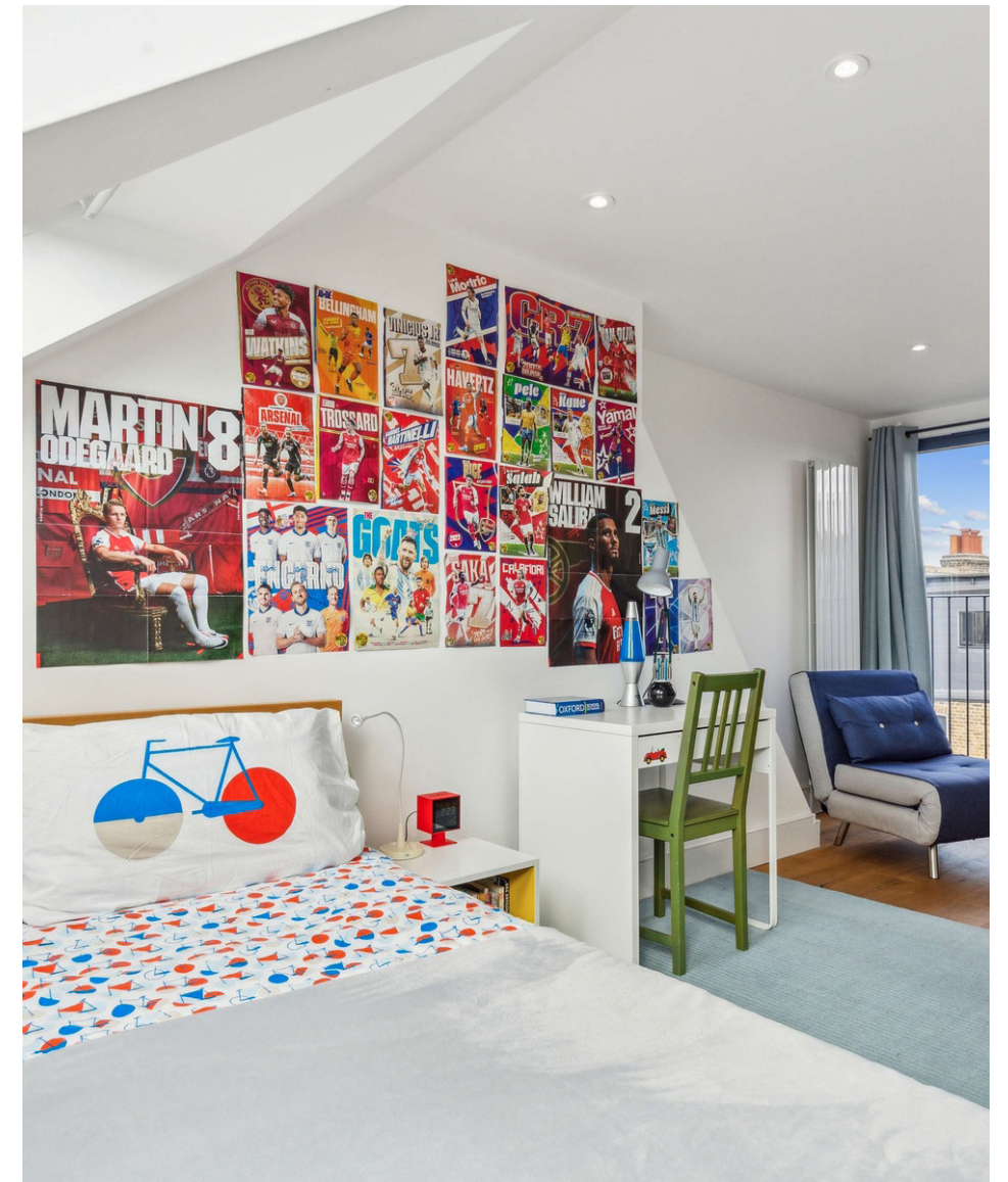
The top floor has a bright loft bedroom with its own ensuite, ideal for a teenager or visiting family. A study sits alongside, tucked away yet connected to the home, perfect for working from home without feeling isolated.