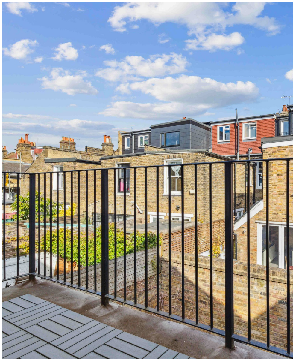
Two further double bedrooms give children or guests their own comfortable corners, one with a balcony for a quiet moment in the fresh air.