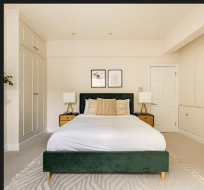
THE PRINCIPAL BEDROOM