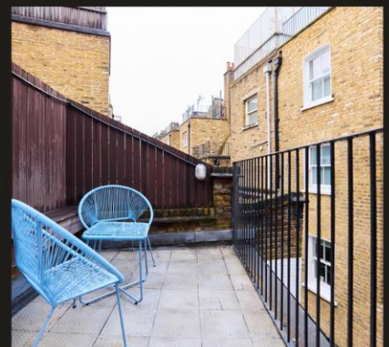
THE ROOF TERRACE