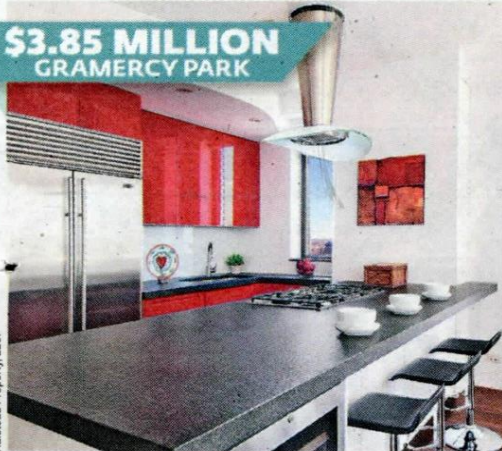
Halstead Property, LLC.

No offense to your powers of imagination, but this duplex penthouse perched 41 (and 42) floors above East 25th Street, off Madison Avenue, "has to be seen to be believed." The suspension of disbelief begins with an "expansive" living area with "breathtaking" views and continues through the designer kitchen, and on up to the master bedroom suite and two private roof terraces with unobstructed "panoramic" views of the city and river. The 1,859 square feet of interior includes two bedrooms, two bathrooms, and opens on to four outdoor spaces altogether (can you believe it?). Agent: Dale Irwin, Halstead Property, 212-381-2228